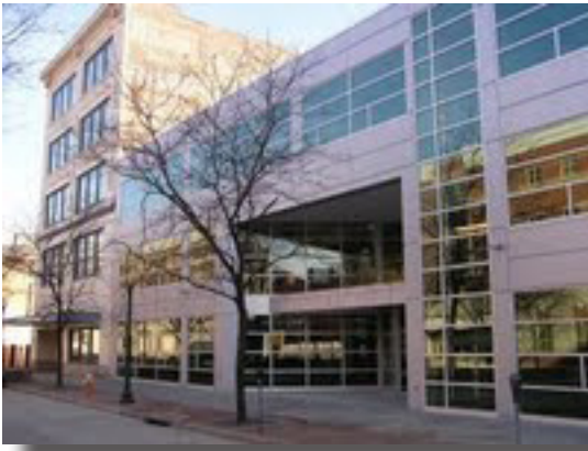
Taft Technology Center, Home of Turning Technologies

4. High-tech center: It's a dream story for an unlikely community. Turning Technologies, a maker of audience response technology and one of the fastest growing software companies in the U.S., is anchored in a brand new building in the "tech block" in downtown Youngstown. The company grew from three employees to about 150 employees, quickly lacked space in its new facility and expanded into an adjacent, newly renovated building. Turning Technologies is among a cluster of tech companies and start-ups in downtown Youngstown that is being billed by some as the Silicon Valley of the Rust Belt.