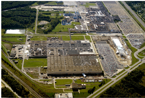
GM Lordstown Complex

1. One of the best places to start a business: The top 10 communities in the U.S. to start a business, according to the August 2009 Entrepreneur magazine, included the usual economic hot spots, Las Vegas, Atlanta, San Diego and Chapel Hill, N.C. But right there among the top 10 was Youngstown. The factors in ranking Youngstown so high: young, dynamic political leaders and exciting and thriving tech ventures like Turning Technologies and the Youngstown Business Incubator.