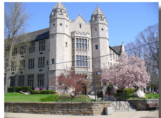
Youngstown State University